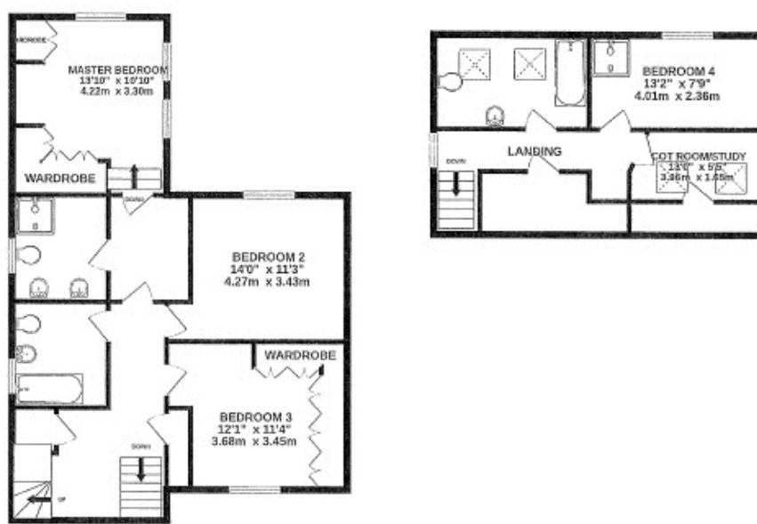
2ND FLOOR 407 sq.ft. (37.8 sq.m.) approx

TOTAL FLOOR AREA: 2755 sq.ft. (255.9 sq.m.) approx.